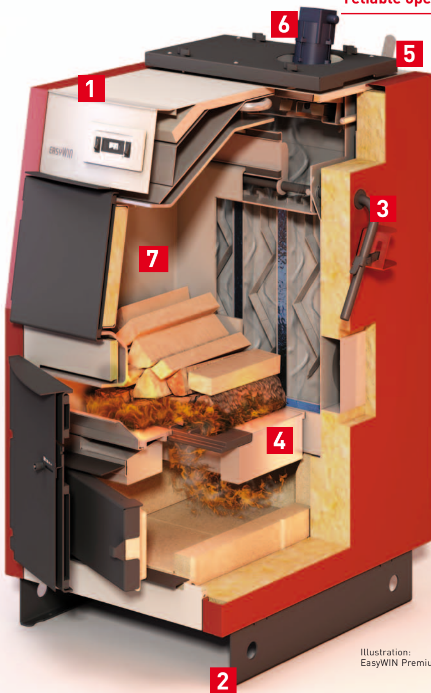
Illustration: EasyWIN Premium