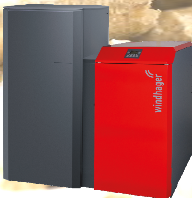
BioWIN lite - 200kg hopper