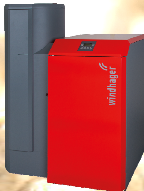
BioWIN lite - 107kg hopper